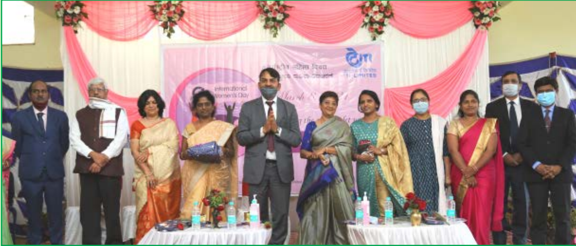
ITI Limited Celebrates International Women's Day 2021