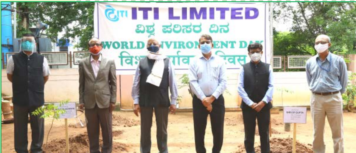
ITI Limited Celebrates World Environment Day 2021